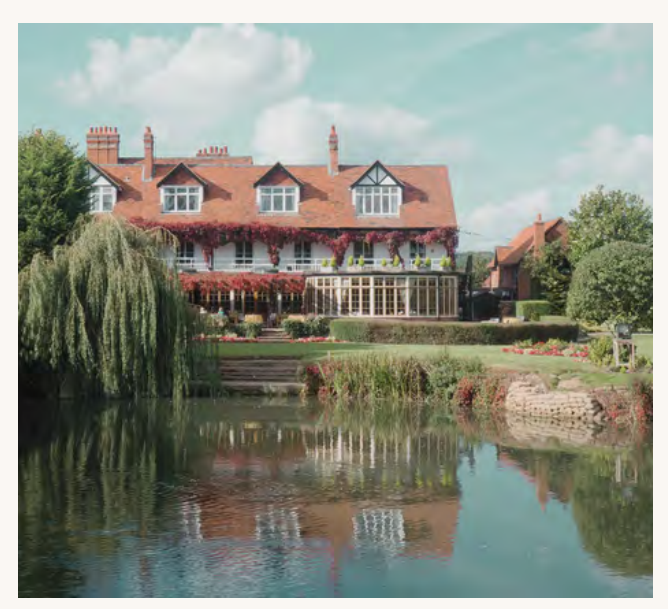
The French Horn

Surrounded by Henleyon-Thames, Reading, Pangbourne, and Twyford, Sonning offers a serene yet accessible lifestyle.