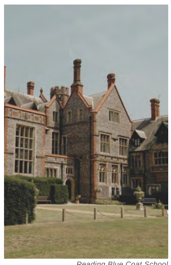
Reading Blue Coat School

international students from over 150 countries