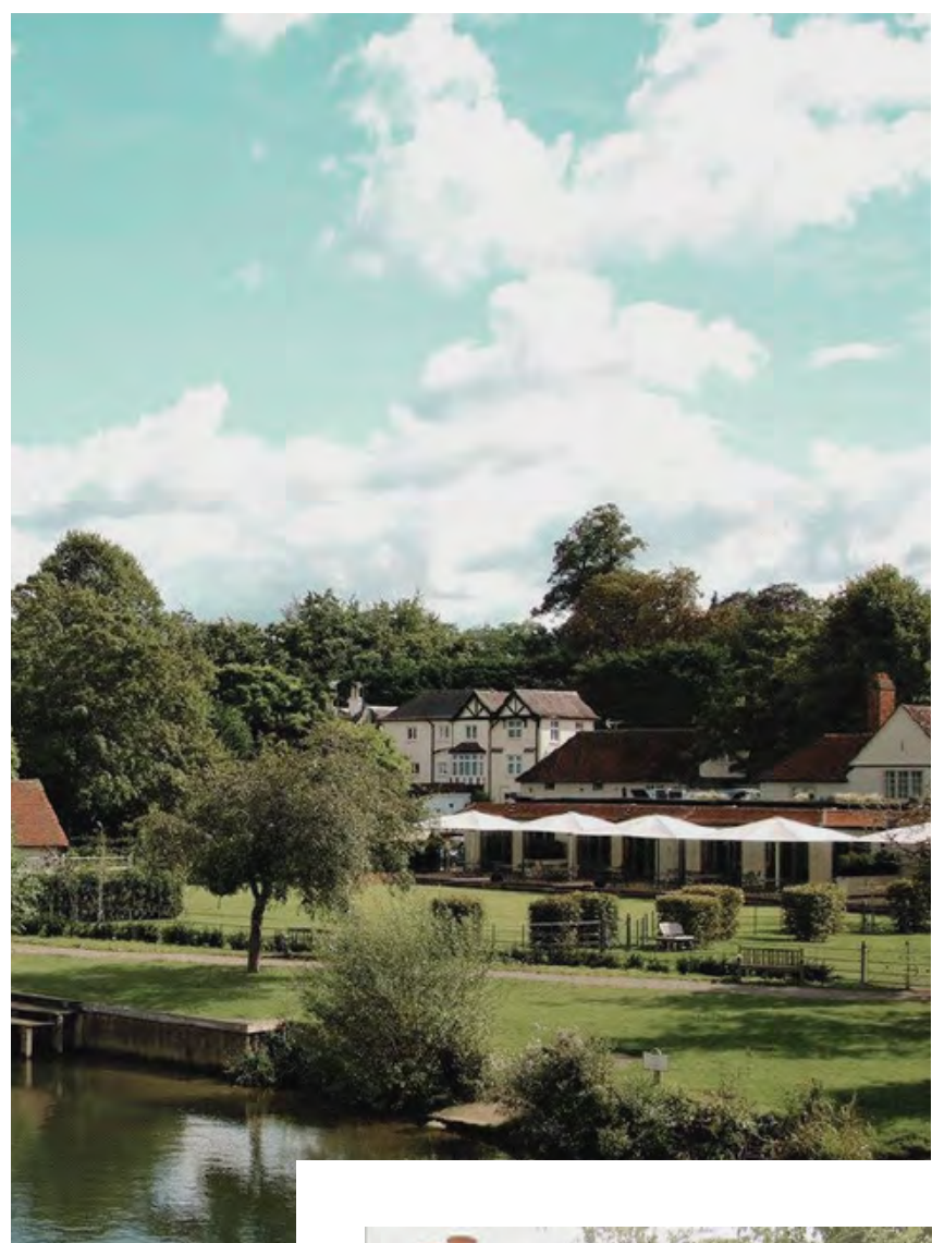
Thameside Manor Sonning