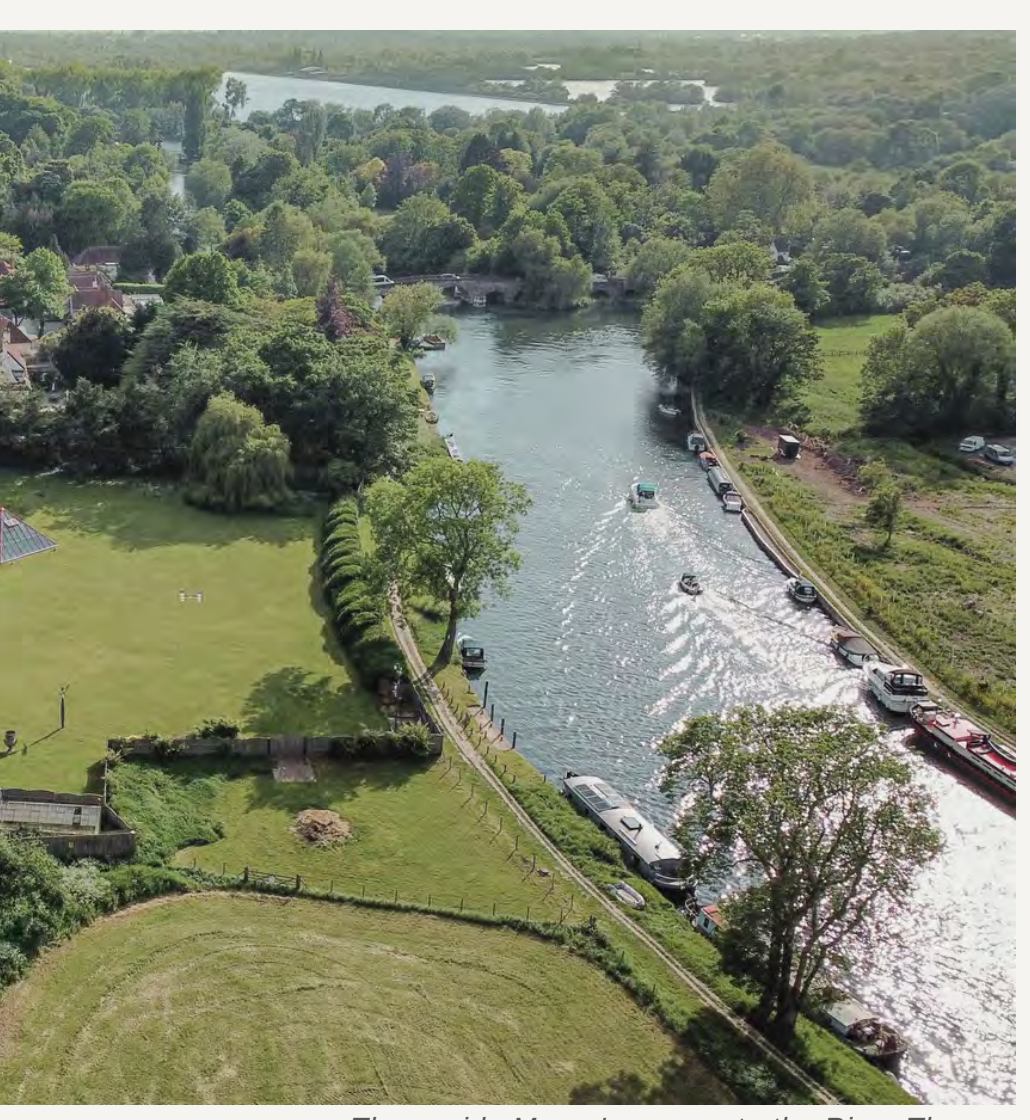
Thameside Manor's access to the River Thames

Situated on the Thames River, Sonning is a charming British countryside village in Berkshire, just a 45-minute commute from London and a quick 10-minute drive to Reading.