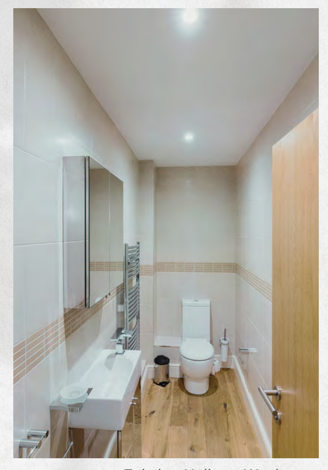
Existing Hallway Washroom

Each two-bedroom apartment offers residents a blend of spacious living and refined elegance, characterized by high ceilings and charming features like crown moulding.