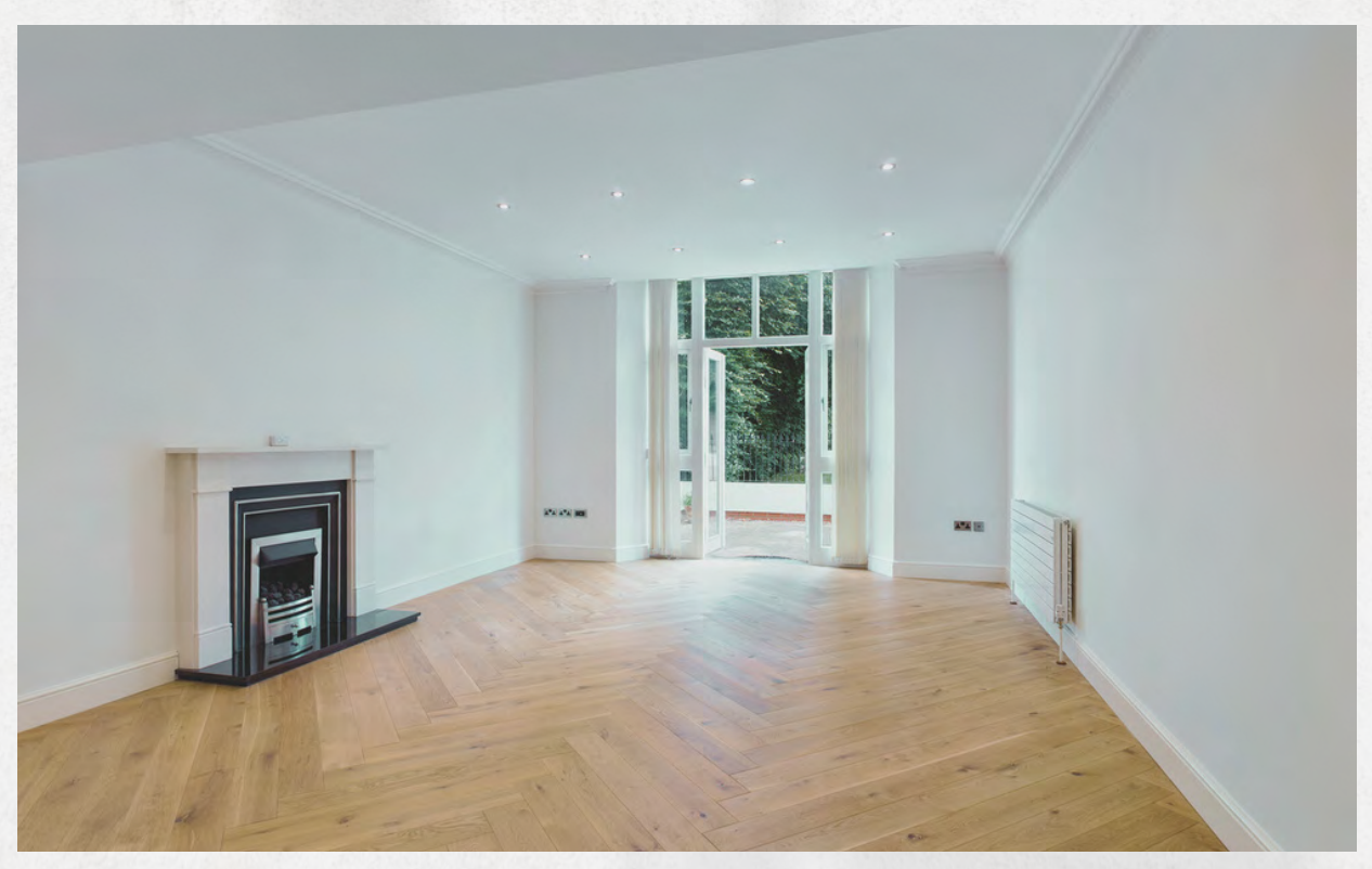
Elegant Living Rooms