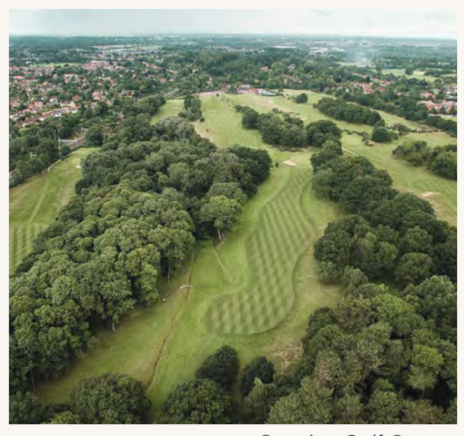
Sonning Golf Course

With iconic spots like the French Horn, the Bull, the Coppa Club, and The Mill Theatre, residents enjoy a mix of culture and leisure. The village boasts the expansive Dinton Pastures Country Park and Sonning Golf Club for outdoor pursuits.