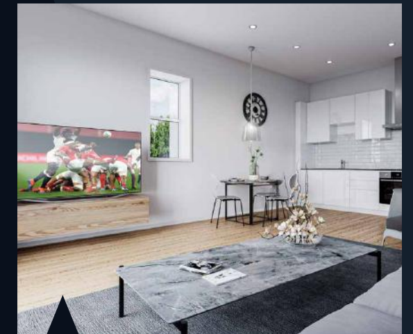
STRATFORD VILLAGE London