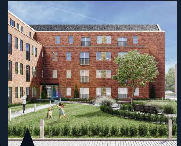
CRESCENT HOUSE Rugby