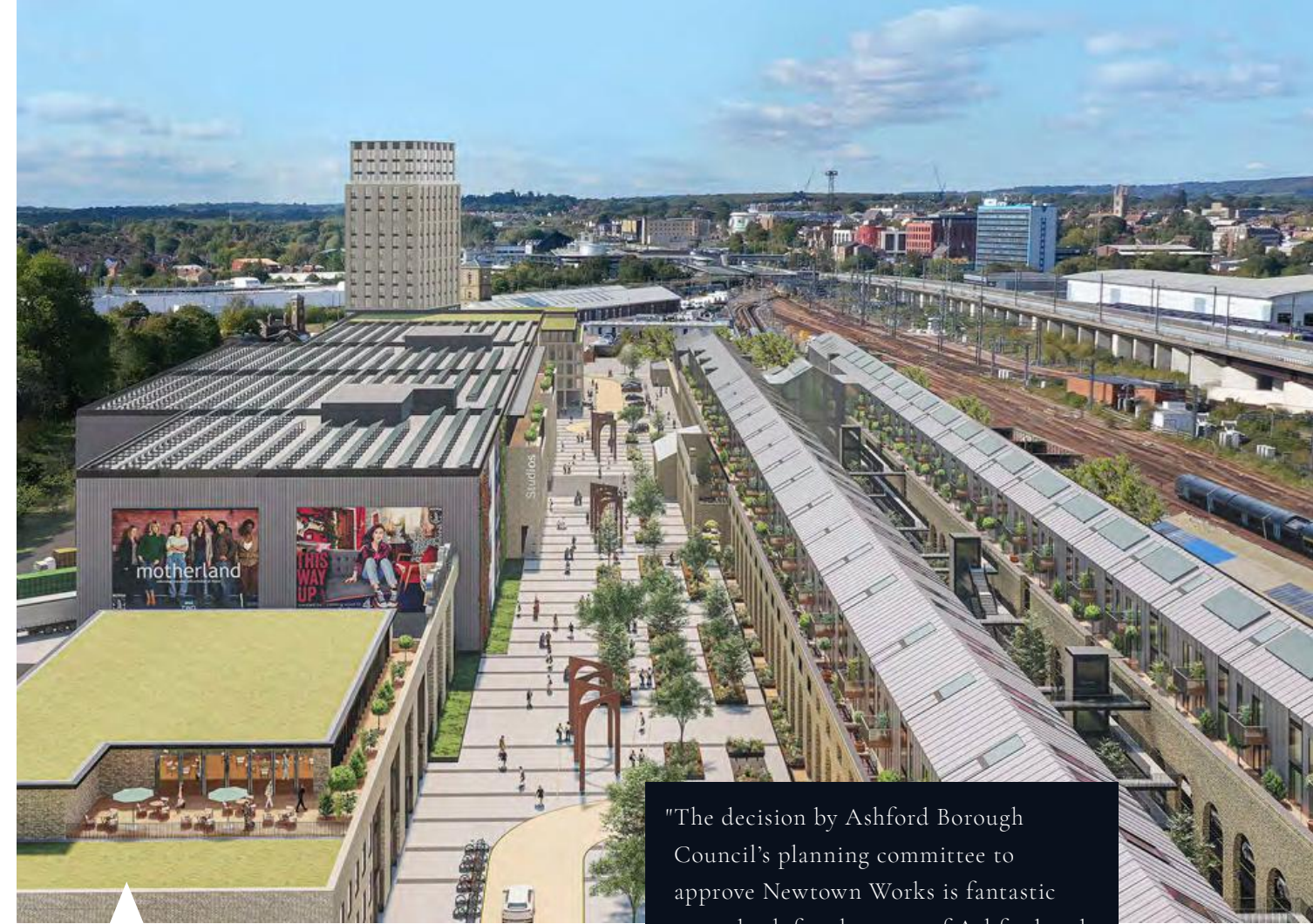
CGI of Ashford International Studios, courtesy of Quinn Estates.

In 2020 planning permission was granted for the ambitious £250m film studio-led regeneration of Newtown Works - a derelict railway works in Ashford.