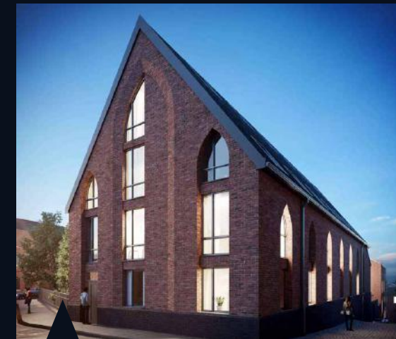
NEW SCHOOL HOUSE Birmingham