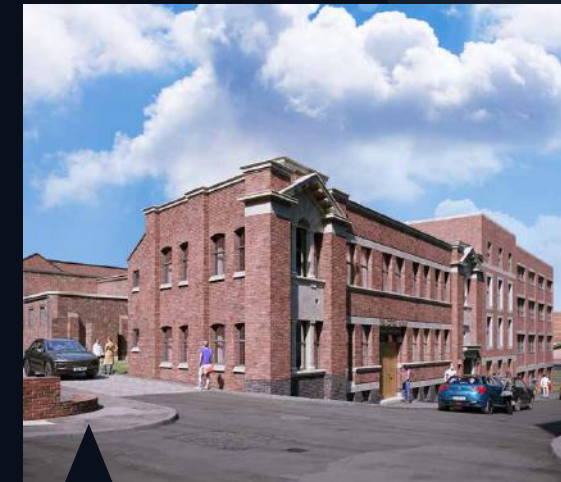
THE COPPERWORKS Birmingham