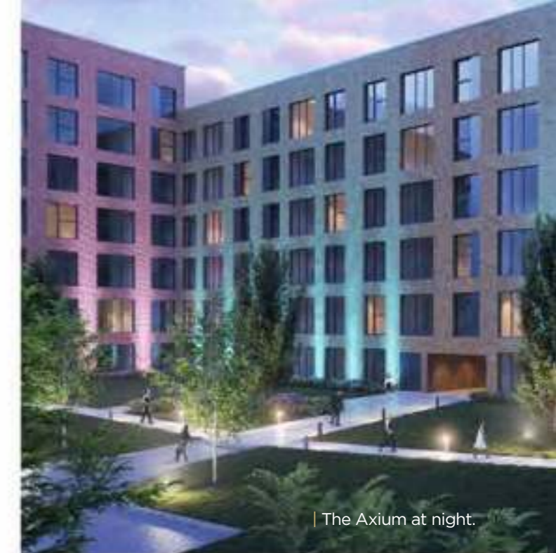
| The Axium at night.