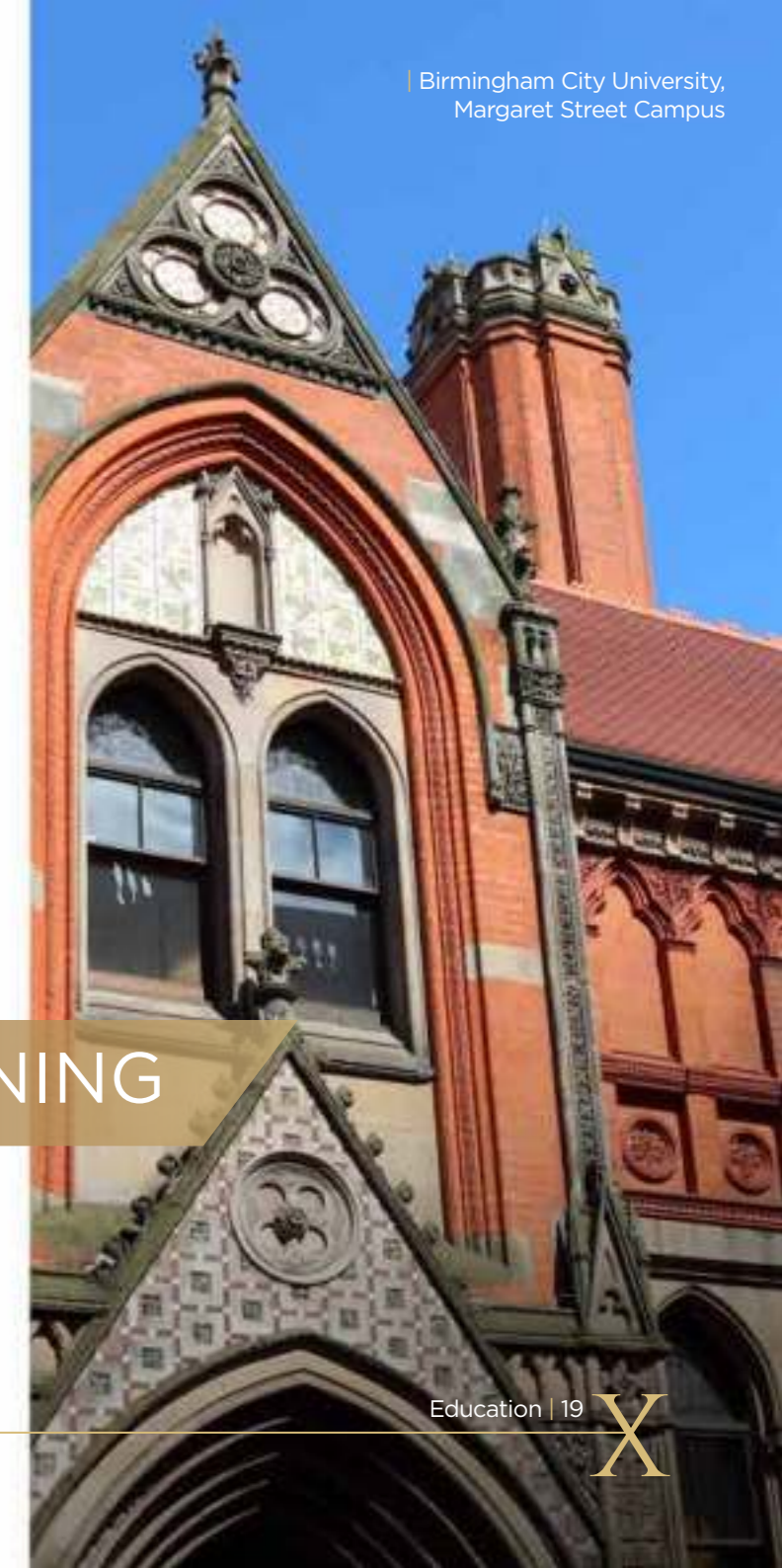
Birmingham City University, Margaret Street Campus