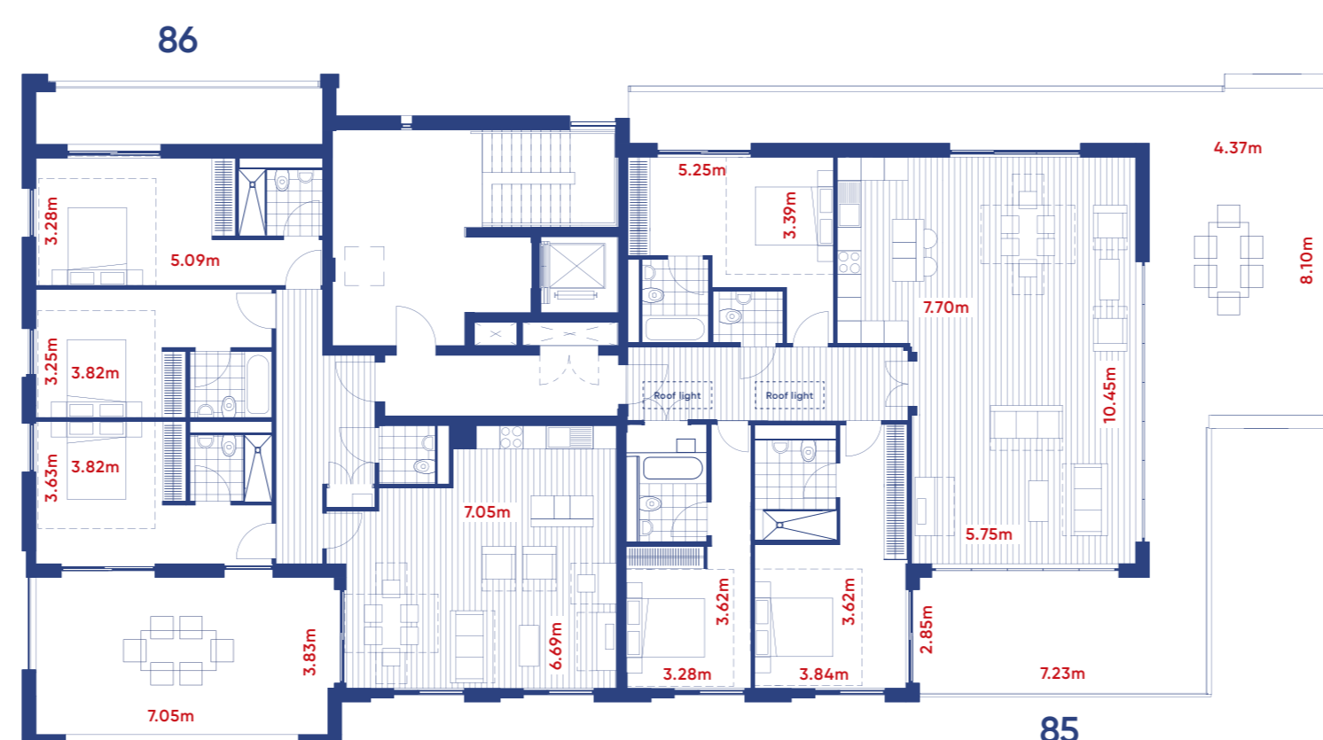
Third floor plan